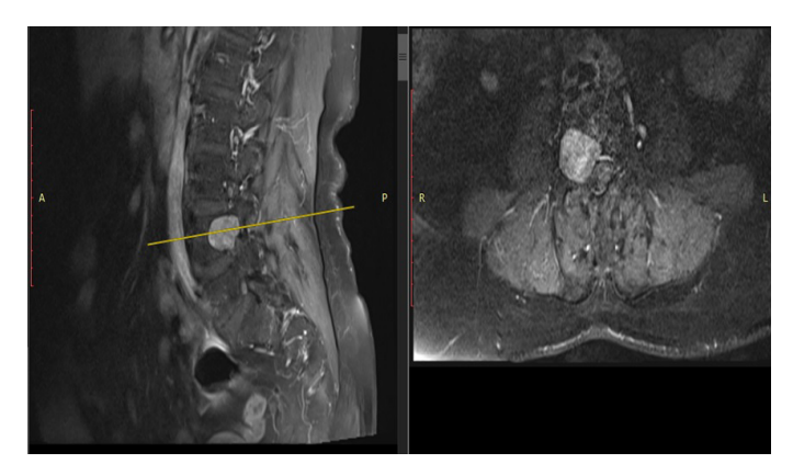
Figure 2. A 70-year-old female patient who experienced low back and right leg pain for 5 months. C+T1WIs revealed a well-circumscribed lesion that eroded the right pedicle of the L4 vertebra and measured 27×28×16 mm, narrowed right L4 foramen and heterogeneous enhancement after contrast. She underwent an operation and neurosurgeons identified the lesion to be intradural extramedullary intraoperatively. GTR was performed. The lesion was confirmed to be a schwannoma. The patient's pain was relieved, and she was intact neurologically on her fifth-year postoperative control visit. Left side: sagittal C+T1WI; right side: axial C+T1WI GTR: Gross-total resection, MRI: Magnetic resonance imaging, WHO: World Health Organisation